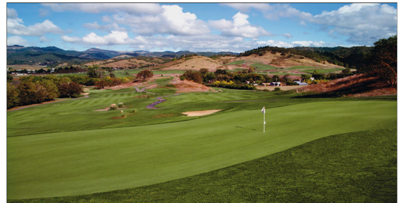
Myrtle Creek Golf Course, located in the scenic Umpqua Valley in Southern Oregon.

With spectacular views of the snow capped peaks of Mt. Hood and Mt. Adams, the sheer beauty of this course can take your breath away. Indian Creek requires accuracy off the tee and